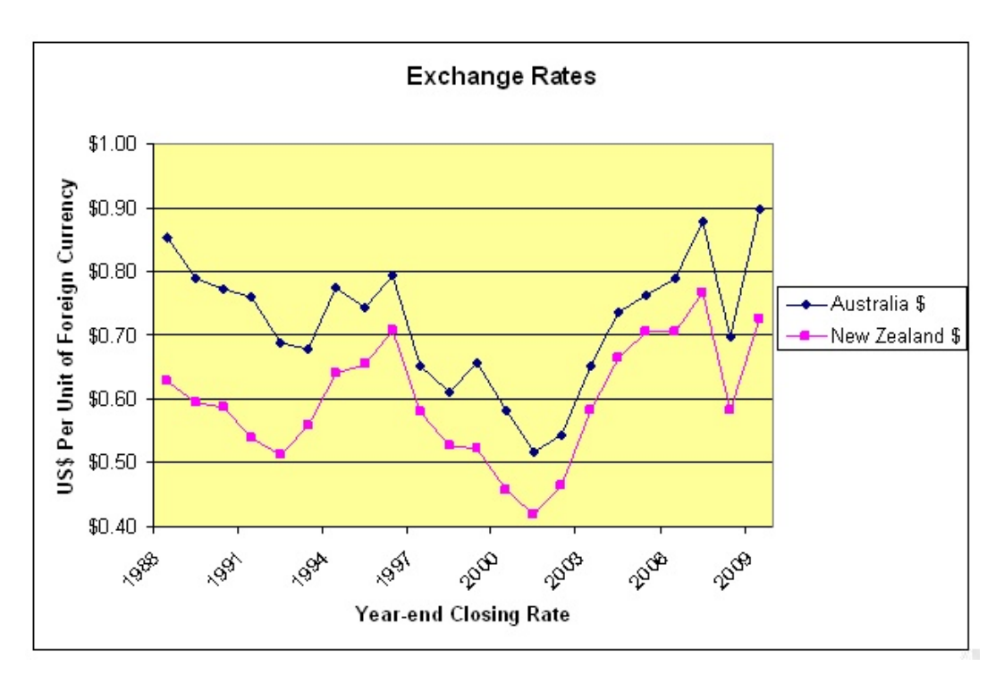
· Risk of adverse government regulation. At the present time, we believe that relations between the United States, Australia, and New Zealand are good. However, no assurances can be given that this relationship will continue and that Australia and New Zealand will not in the future seek to regulate more highly the business done by US companies in their countries.